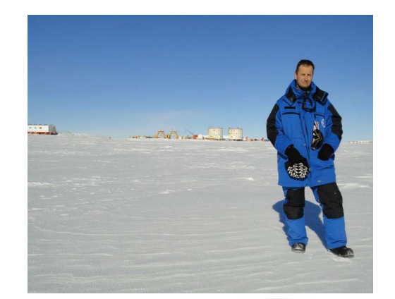
Technical Intervention on the Station in 2010/2011

The training of future overwinterers (technical staff and ESA doctor)